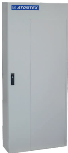
PRM consisting of: BDRM-05 and BDKN-05