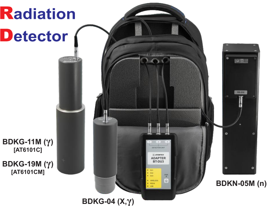
BDKG-11M (γ) [AT6101C]